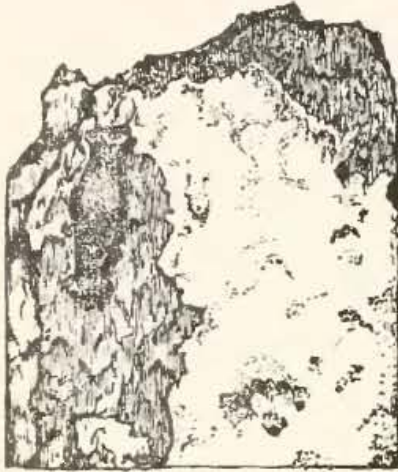
Case of Tinea croceoverticella Chamb.

gus. The case is formed of closely packed particles of frass and sawdust, and is lined with a dense sheet of grayish white silk. It is 8 or 9 mm. long, broadest in the middle, tapering